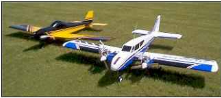
Earl Cox's new stuff