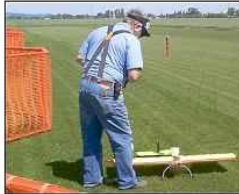
Where did all the beans go?