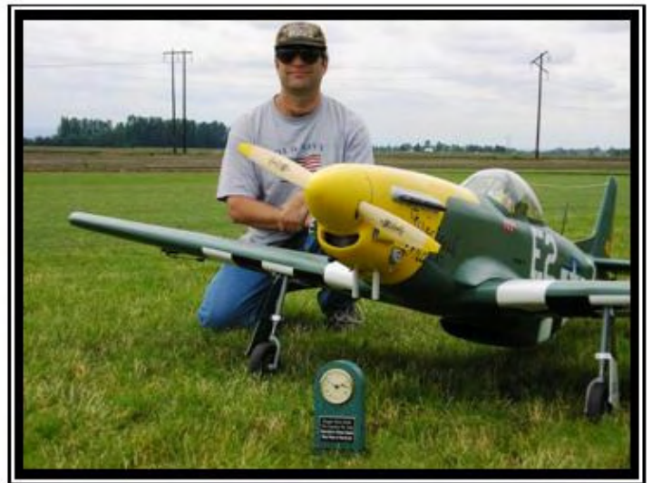
Steve Stricker and "Ferocious Frankie", his Nosen P-51