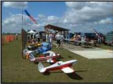
Looking south, down the flight line. Ken Solomon's Ryan in the foreground