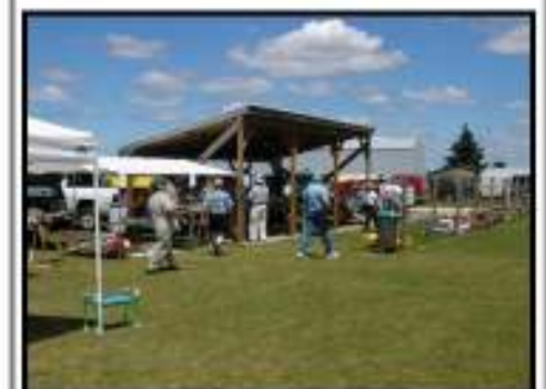
The Flight Line, Looking North