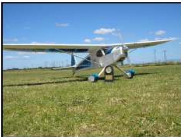
Spectators Choice, Gus Opall's Rascal 110. Saito 150