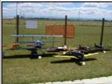
Paul Witkowski brought this stable of 6 planes