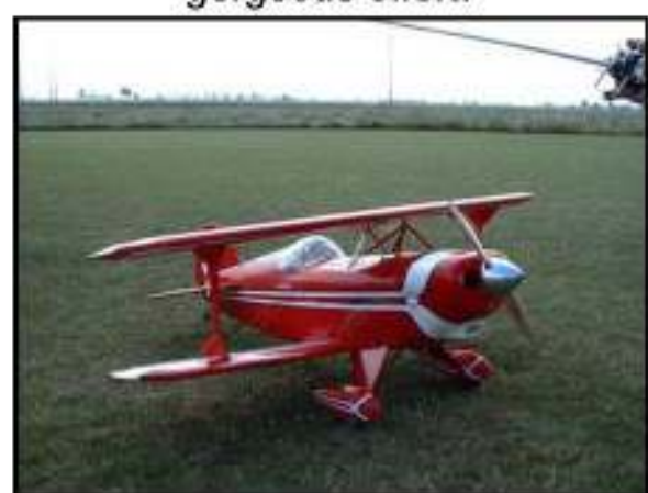
Sergei Dennebaum's Pitts Special. OS Pegasus 4 Cylinder