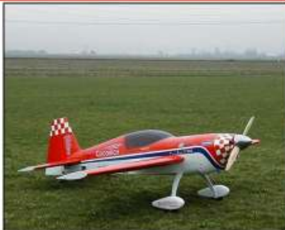
Cliff Farnham's Extra 300 while undergoing engine break in at the field this month. Not flown yet